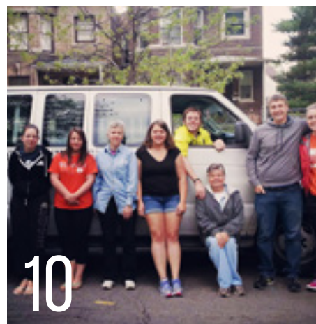
10 URBAN PLUNGE