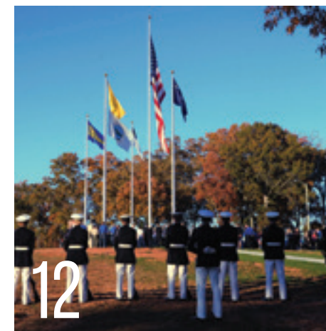
12 FLAG PLAZA DEDICATION